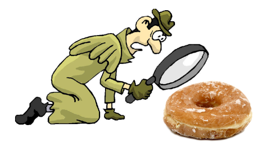
Figure 2: The major piece of evidence for today's unsolved crime streak

Today is your day. Your task is to implement a new agent that looks for the records in the database that bear a strong resemblance to the given signature of a dropped donut found at a new crime scene.